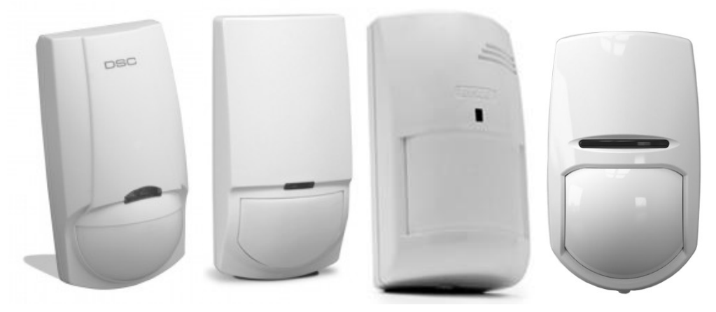
Fig. 1. PIR/MW detectors (from the left: DSC/LC-104-PIMW; CROW/SWAN 1000; RISCO/RK415DTDEB; Pyronix-Hikvision/KX15DT)